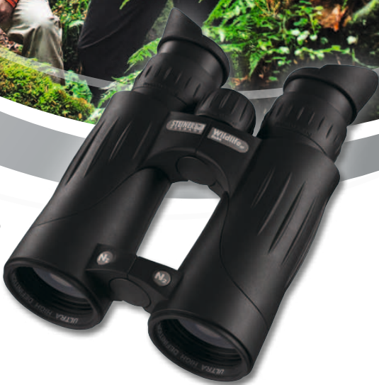
Wildlife XP 8×44

As with all STEINER binoculars, the Wildlife XP models also offer legendary durability. The lightweight die cast magnesium alloy housing is corrosion-free and shock proof. Our comfortable NBR-Longlife rubber armouring withstands the effects of oil, acid or climatic influences. Even in extremely wet conditions, heat or cold the surface stays grasp and slip proof. In addition the binoculars are nitrogenpressure filled via a two-way-valve-system that prevents fogging up and from condensating inside the binocular.