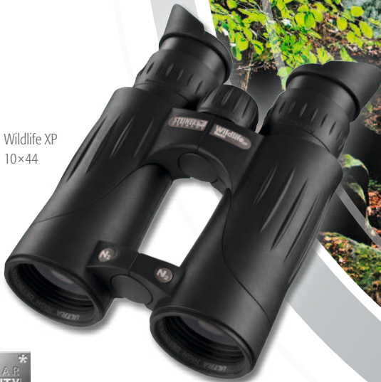
Wildlife XP 10×44

The special level of comfort is not only due to the technical settings, but also to the handling of the Wildlife XP. The sophisticated ergonomics of the ComfortGrip thumb rests with Technogel stand for a safe and fatigue-proof, long-term observation, even with one handed use. A perfect balance is guaranteed. Individually adjustable rotating eyecups made of silicon protect against indirect light and wind draughts.