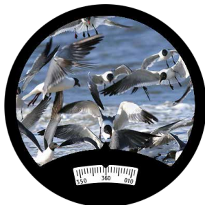
HD STABILIZED COMPASS