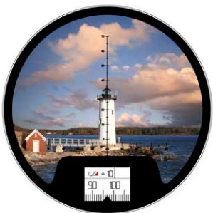
WORLDWIDE DIGITAL COMPASS