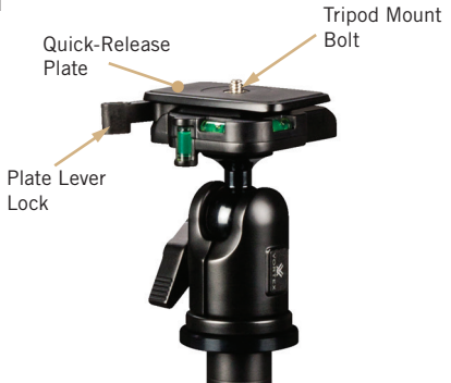
Flip the plate lever to lock/unlock plate.

holder. Flip the plate lever fully back into the lock position so the quick-release plate rests securely in the holder.