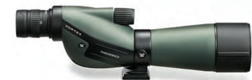
20-66 X 60