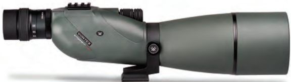
20-60 X 80

For long-range observation, Viper HD spotting scopes put incredible viewing at your fingertips. Count on HD extra-low dispersion glass for impressive resolution and color fidelity and XR fully multi-coated lenses for maximum brightness.