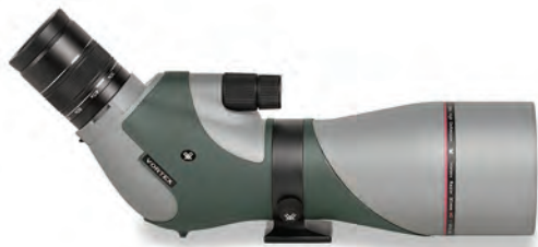
20-60 X 85

>>> THE OLYMPIAN OF SPOTTERS. Quite simply, this is one of the finest spotting scopes on the market. Our Razor HD competes at the highest level of performance! The sophisticated triplet apochromatic lens system delivers eye-popping, high-definition images across the entire field of view with no color fringing, resolution degradation, or color fidelity dilution at extreme distances. If you are looking for the best spotter money can buy, this is it.