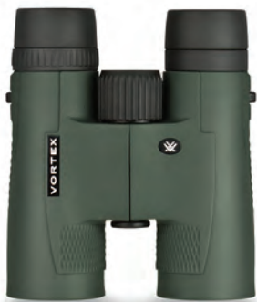
10 X 42

Feature for feature, you just won't find what the new Crossfire II has to offer on any other value-priced binocular. Period. What's more, the fully multi-coated optics deliver performance that most assume is only available in binoculars costing twice as much. Add complete waterproof/fogproof protection, twist-up eyecups and a rubber armored chassis and the Crossfire II is a rare find.