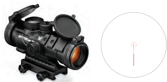
3X WITH EBR-556B RETICLE