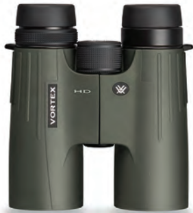
10 X 42

This is a fantastic high-end optic in a small, light, and incredibly strong chassis. The advanced optical system in this powerhouse uses HD, fully multi-coated lenses for superior light transmission and clarity. The Viper HD is wingman to our Razor line in terms of optical performance and is one of the best sellers in the Vortex line.