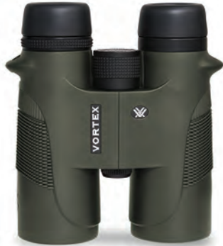
10 X 42

The Diamondback provides 90% of the optical quality as the best binoculars out there for a fraction of the price. With the largest-in-class field of view, enhanced fully multi-coated optics, phase-corrected prisms, waterproof and fogproof construction, soft tapered eyecups, and rugged rubber armor, it's no surprise this is our number one selling binocular.