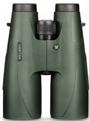
15 X 56

With 56mm objective lenses, Vulture HD series binoculars deliver absolutely incredible light transmission and superior low light performance—a critical attribute at dawn and dusk when game can be most active. Phase-corrected roof prisms, fully multi-coated optics, and our exclusive XR coatings deliver an edge-to-edge super bright image.