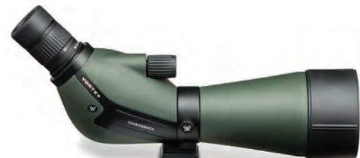
20-60 X 80

When cost is a factor but having superior quality optics is a must, the Diamondback delivers. When designing this affordable spotter, we knew fully multi-coated lenses for brightness, with a rugged, waterproof, shock-resistant construction were must-haves. If you are a beginner, or a hunter on a budget, but you still want quality, the Diamondback is perfect for you.