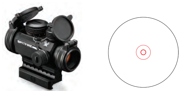
1X WITH DRT MOA RETICLE

When fast target acquisition in close- to medium-range shooting applications is a priority, Spitfires excel. Designed specifically for the AR platform, Spitfires combine an impressive array of high-performance features into rugged, ultra-compact packages. The sophisticated prism-based design allows for a more compact optical system without sacrificing a shred of optical quality. Selectable red/green illuminated reticles, with five intensity levels, are etched directly on the prism to assure consistent point-of-aim at all times—even when the illumination is not engaged.