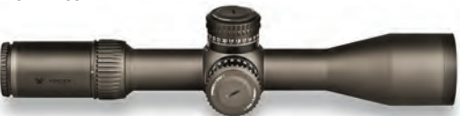
3-18 X 50