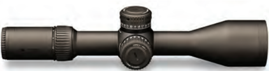
4.5-27 X 56

Extra-high quality glass, superior construction, and innovation upon innovation make the Razor HD Gen II riflescopes the top of the line by every measure.