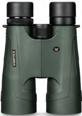
15 X 56

The ultimate long-range binocular. The Kaibab HD is designed specifically for western hunters who plan to use their binoculars with a tripod to survey wide-open landscapes at great distances. Even the smallest detail is sure to be seen in extraordinary clarity with the Kaibab HD.