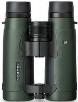
10 X 42

If high end optical performance and enhanced comfort that won't break the bank is your thing, then the Talon HD is the bino for you. HD, fully multi-coated lenses for enhanced light transmission and clarity give this mid-priced bino the optical performance of its big dollar competitors. The sleek open hinge design is carefully balanced and perfectly weighted.