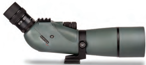
15-45 X 65