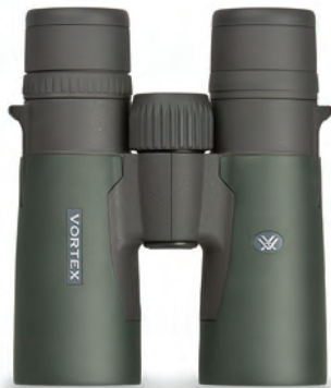
10 X 42

The Razor HD binocular, the pinnacle of the Vortex line, provides unparalleled image clarity, and outstanding toughness and durability. We engineered this stunning binocular with only the best quality materials. Hand-selected prisms and premium HD extra-low dispersion glass offer clear, bright images—even in low light conditions. The full magnesium chassis gives superior strength and makes it the lightest weight premium binocular on the market. To put it simply, the Razor HD can't be beat.