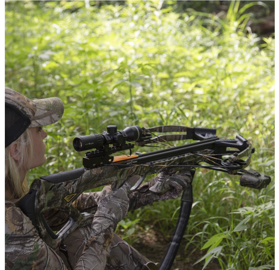
A crossbow with a mounted scope