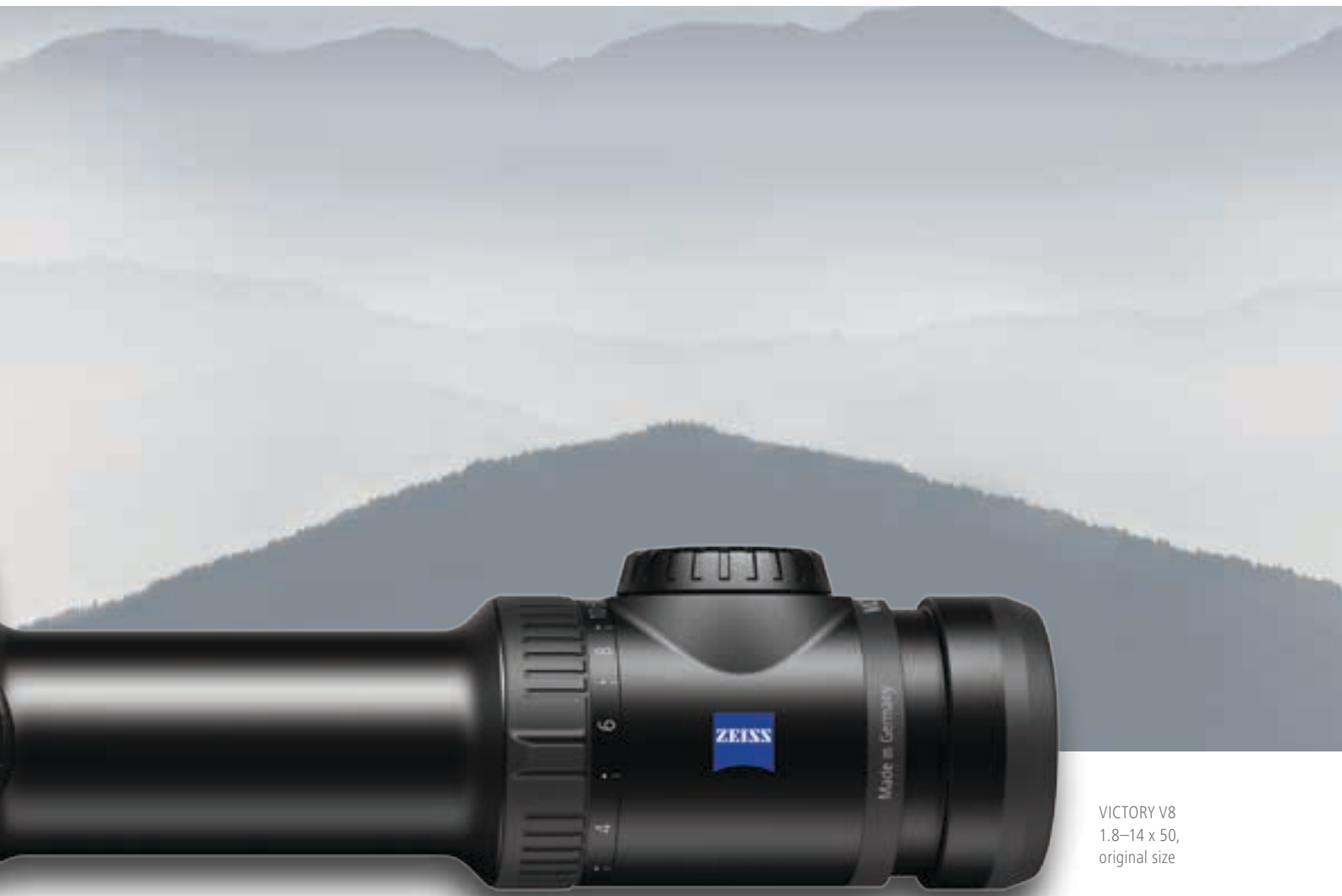
VICTORY V8 1.8–14 x 50, original size